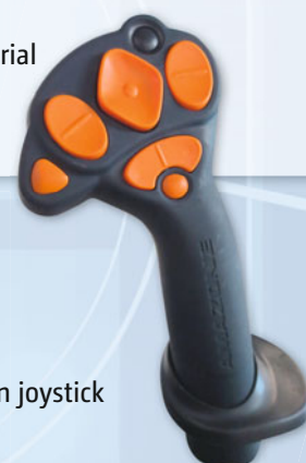
AmaPilot + multi-function joystick